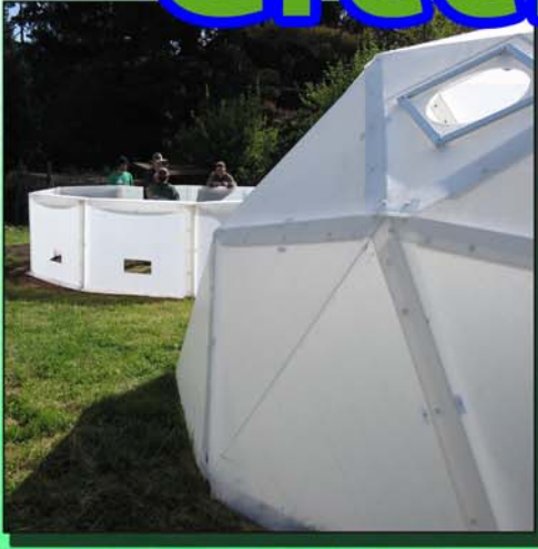
Green-Dome assembly is simple with thorough instructions. Local assembly assistance is available.