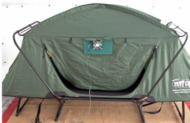
TENT COT WITH HEATER, FAN AND LIGHT