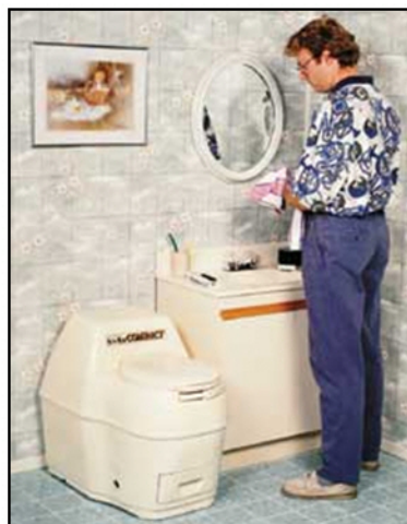
COMPOSTING TOILETS IN SEVERAL MODELS FOR DIFFERENT CLIMATES