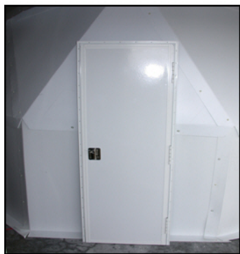
ALUMINUM 24"x72" "DOOR & SCREEN DOOR" FOR U-DOME EXTERIOR (above) INTERIOR (below)